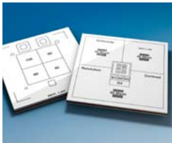
Model L656, L647

Radiographic/Fluoroscopic image quality & performance