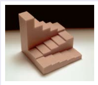
Digital Step Wedge Model 081